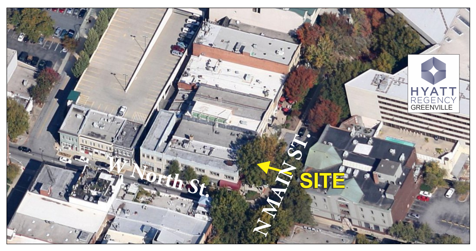
BUILDING BACKS UP TO THE NORTH LAURENS STREET PARKING DECK - CITY OWNED, 179 SPACE, TWO-LEVEL PARKING DECK THAT PROVIDES MONTHLY AND DAILY PARKING IN THE DOWNTOWN AREA